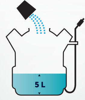
Fill the sprayer with 5 L of water