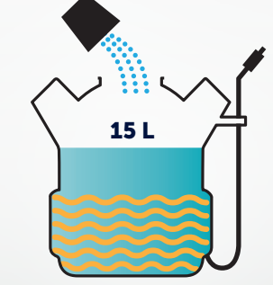
Agitate thoroughly and top up to 15 L

Add 1 L of Enclean<sup>®</sup> to the water